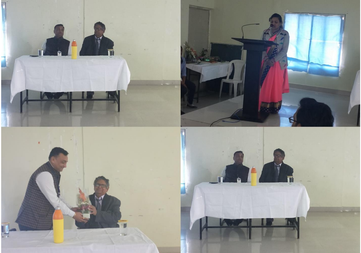
Photo: Guidance on Industry-Institute Linkage